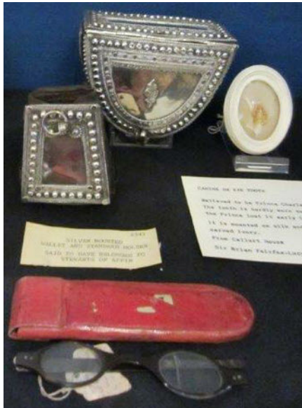
Lord Lovat's spectacles and case

Edward Stuart's bonnet from Moy Hall. More bizarrely there is a fragment of a dress worn by Flora MacDonald and the spectacles and case belonging to Lord Lovat of the '45. According to the picture of the good gentleman he was a large, not very handsome gentleman, so the spectacles must have perched very precariously on his bulbous nose.