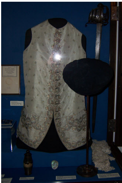
A blue bonnet belonging to Prince Charles Edward and supposedly left by him at Moy Hall

These artefacts included a selection of Jacobite memorabilia ranging from candlesticks belonging to James VII and II to various beautiful miniatures of the exiled Stuart family. The Jacobite collection also includes Prince Charles