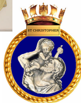
Right: St. Christopher badge