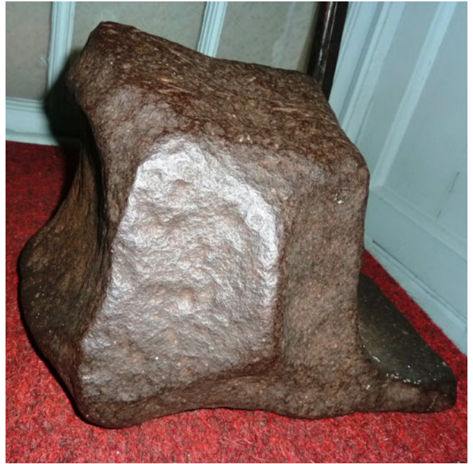
The 'Clanranald Anvil' - story opposite

Bring coats and boots to walk around the grounds. Children and dogs are welcome too.