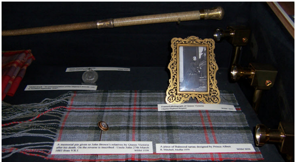
A framed picture of Queen Victoria and Queen Victoria's riding whip.