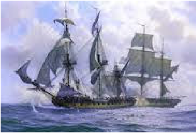
The French ship Bellona

On 30 April 1746 two ships, the Mars and Bellona, dropped anchor in Loch nan Uamh, Arisaig and unloaded seven casks of gold coins intended to fund the Jacobite cause and Bonnie Prince Charlie's last attempt to regain the British throne for the Stuart dynasty. However, the gold arrived two weeks after the Jacobite surrender at Culloden and shortly afterwards disappeared.