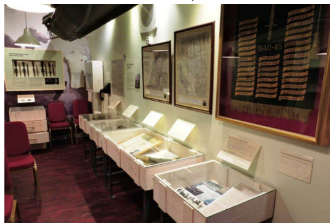
Part of the revamped exhibition