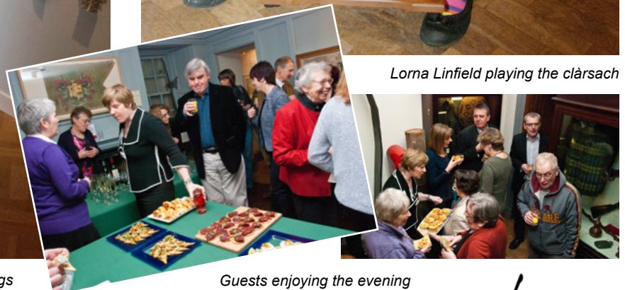
Guests enjoying the evening