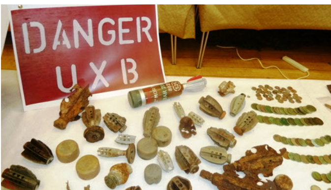
Items found by the Lochaber Archaeological Society on display at Caol Community Centre on 30th August