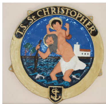
Left: The picture of St. Christopher currently on loan to the Museum