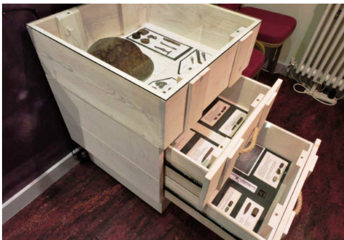
Archaeological finds found at Achnacarry now on display in the Museum