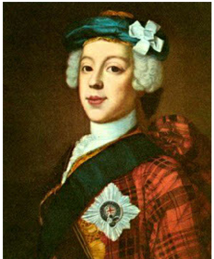
Bonnie Prince Charlie