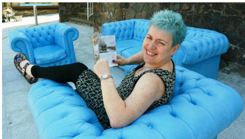
The newly refurbished Cameron Square